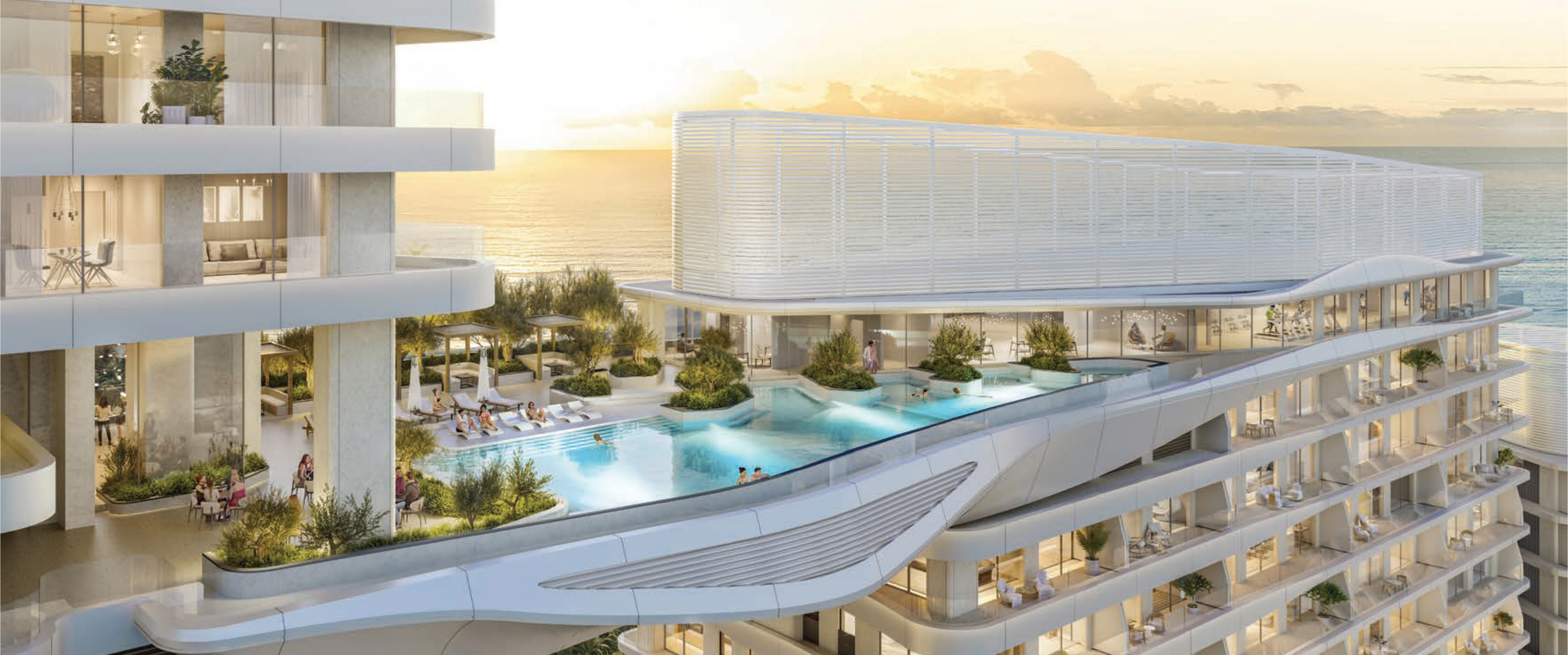
Adult Sky Pool