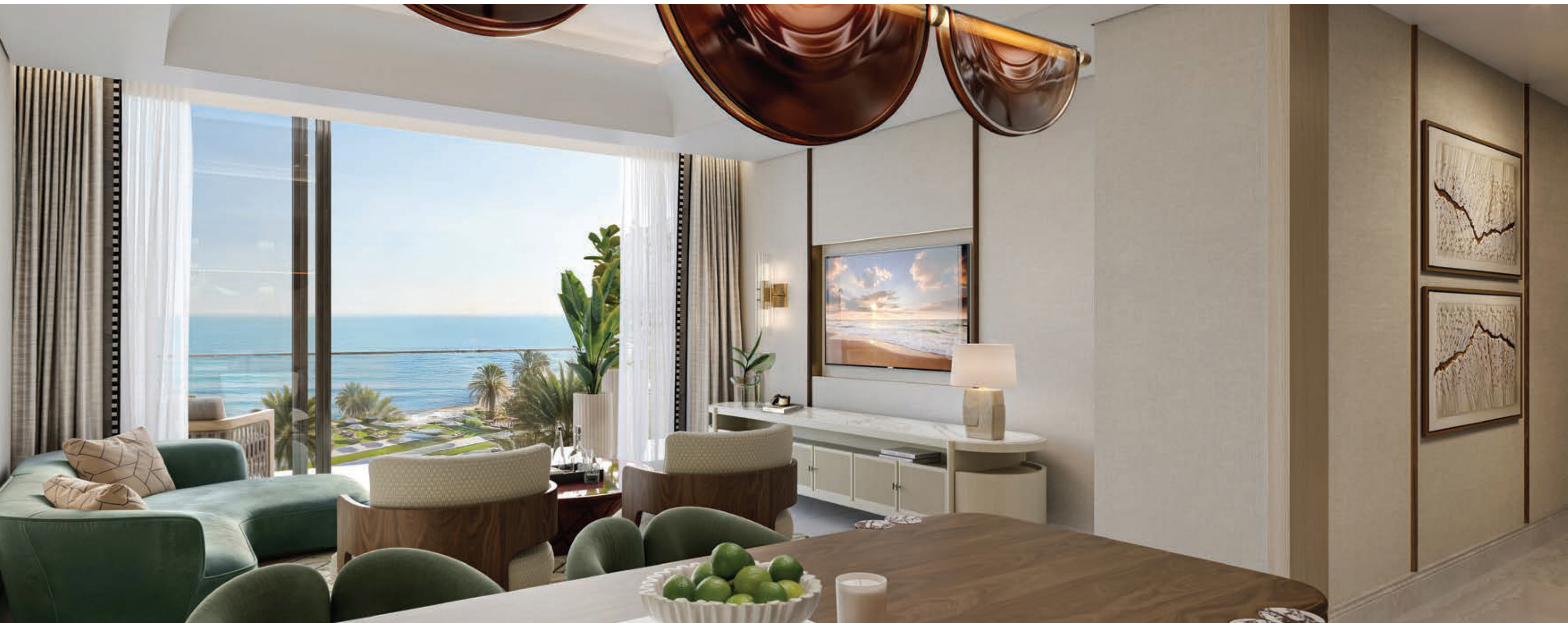
Two Bedroom Residences

Our expansive two-bedroom residences are a masterpiece of balance. Inside, everything speaks of refinement, from the tactile richness of materials to the modern design.